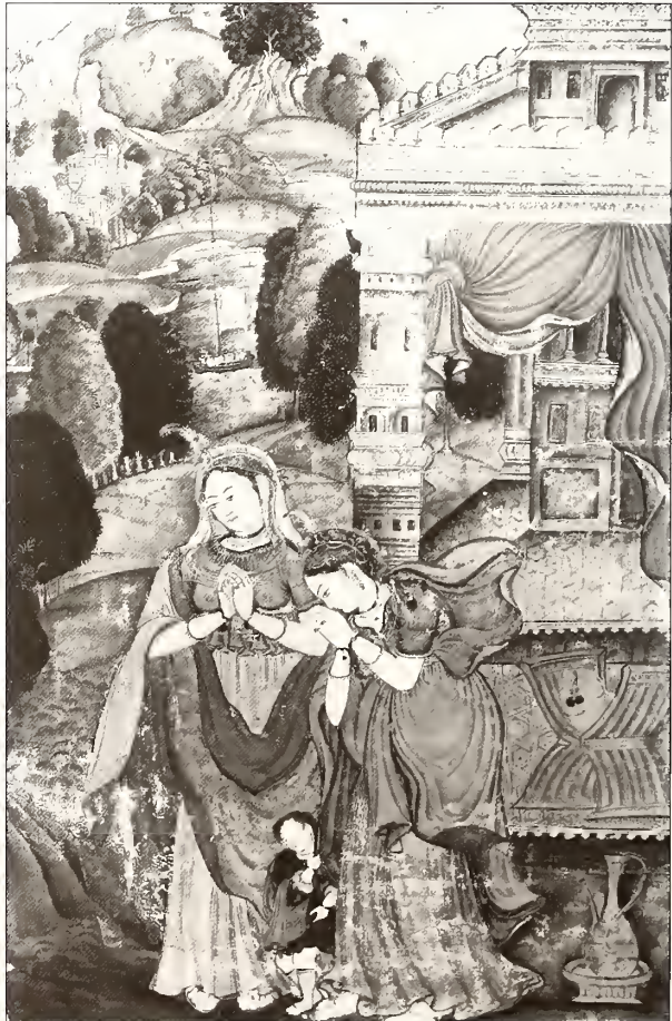
Figure 12. Ladies Praying with a Child . India, Mughal period, Akbar period, ca. 1580. Album page; opaque watercolor and ink on paper, 21 x 14.4. Private collection